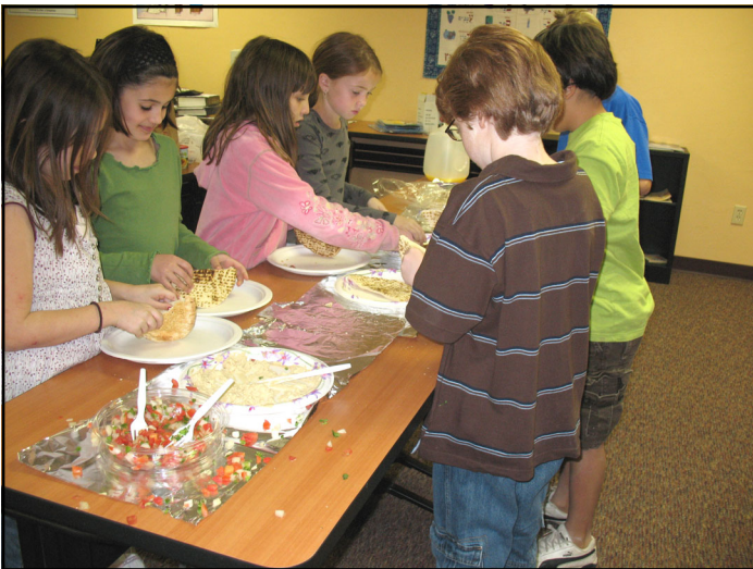
(above) The Israeli Cooking Elective class makes pita sandwiches for the falafel they cooked.